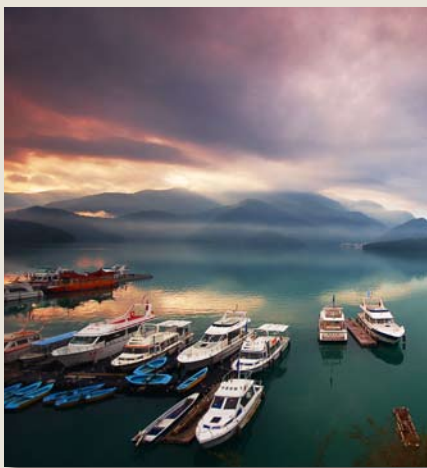
Sun Moon Lake