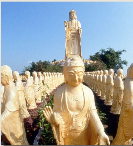
Fo Guang Shan Monastery